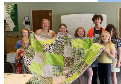
Quilting Day in 2025

Wednesday, June 24 , 9:00am -3:00 pm, we will have a Kid's Quilting Day for kids who have completed 2nd grade and older! The day will feature a quilting project led by our wonderful quilters for the kids to complete. Everyone will get an opportunity to work with our expert quilters and a turn to use the sewing machine. The day includes a pizza lunch, please sign-up at this link: https://www.signupgenius.com/go/70A0B44AFA62DABFE3-64188158-kids#/ If you have any questions about this event, you can contact Edie Schultze or Evan Fitzsimmons.