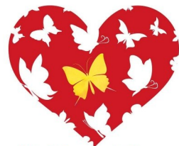
Grief Support Group