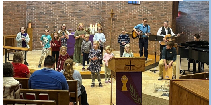
Youth Choir singing in March

*Youth Sunday will be at both services on Sunday May 17.