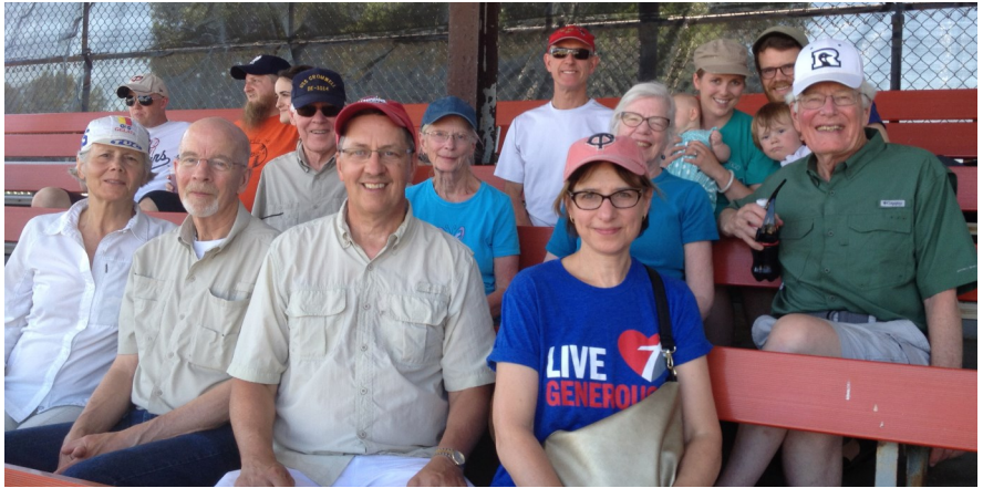
Great day at the Honkers game!