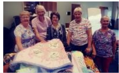
Some of the quilters with a recent donation of 30 quilts to Bright Futures .