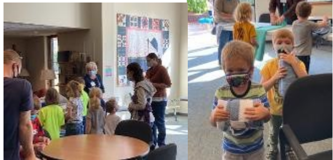
More photos from the October Service Sunday

Instead of Sunday School on November 14, we will continue the Second Sunday Service Projects. Meet at 10:30 am in the Gathering Area and please bring masks. Kids will complete the project, making Nativity ornaments for shut-ins and we'll have some time for music as well. All ages are welcome.