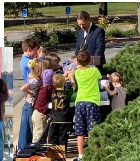
Photos from the October Service Sunday