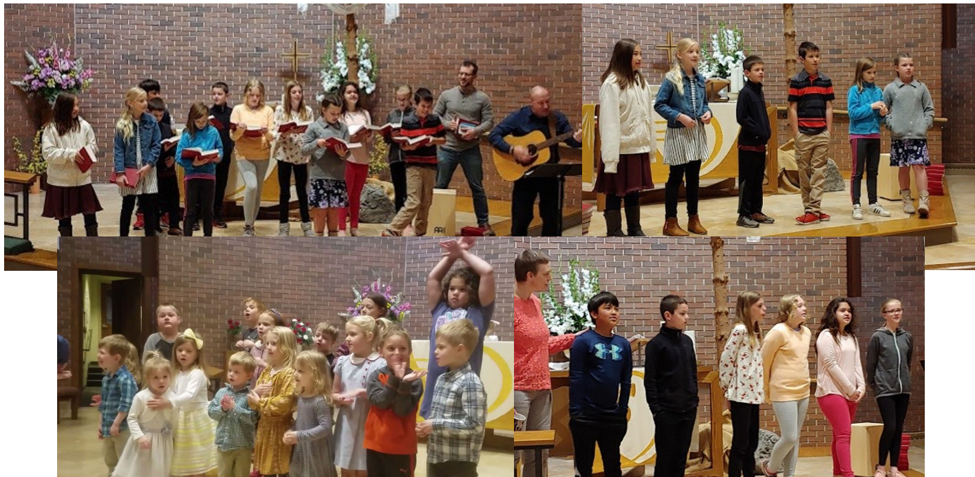
Sunday School students presented songs, the creed, and recited the books of the Bible on the last Sunday of Sunday School on May 19. Thank you students and teachers for your good work!