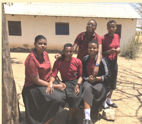
Students on the Hull campus.

You may not know that Mount Olive built the first dining hall for Hull High School in Kijota, Tanzania, many years ago, when that school only housed 30 students. Now Hull High School, an important ministry part-