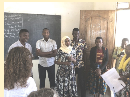
Teachers at the Hull school.

ner of ours, has grown to over 200 students! Needless to say, the dining hall we built is now completely insufficient. Students generally eat outdoors these days. Because this is a crucial part of the campus, and because Mount Olive built the first one, we want to build the new dining hall at Hull High School. The cost has been estimated at $30,000. As part of the 60 th anniversary fund, we hope to raise that money this year – indeed, as soon as possible , so that the construction can begin. Be praying and preparing now for your support of this important ministry.