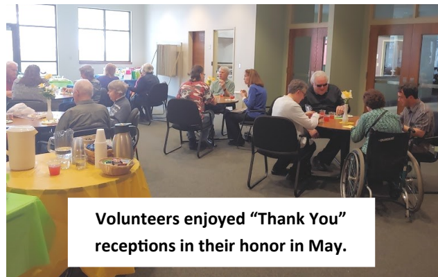
Volunteers enjoyed “Thank You” receptions in their honor in May.