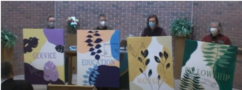
New artwork for the Fellowship Hall depicting our four pillars was unveiled at the Annual Meeting.